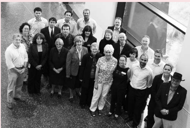
The Broome to Berrima research team

This is an opportunity to create an Australia-wide network for sharing knowledge in this field, and to maintain Australia's position as a world-leader in the area of offender health research. Outcomes will include better health services for Indigenous offenders, and more generally improved health and wellbeing for those in the communities from which they come, and to which they return. The project has the support of several national centres and a range of experts.