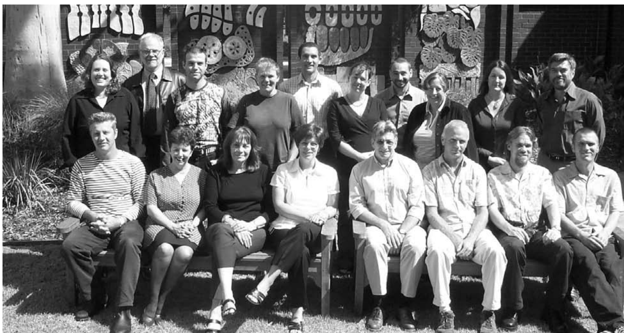
National Drug Research Institute Staff