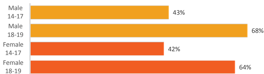
Figure 2. Proportion of participants who had pre-drunk on their last risky drinking session

Though there were no significant differences in engagement by gender, participants aged 18-19 were more likely to pre-drink than those aged 14-17 (42% vs. 66%).