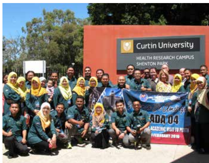
NDRI hosted a workshop for a Malaysian university delegation of over 30 students and staff on an academic visit looking at drug and alcohol treatment in Western Australia.